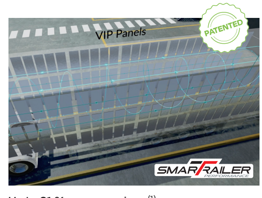
Up to 21 % energy savings (1)