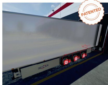
Safety for dock operators

Anti-unplanned departure Safeloading-C<sup>(5)</sup>