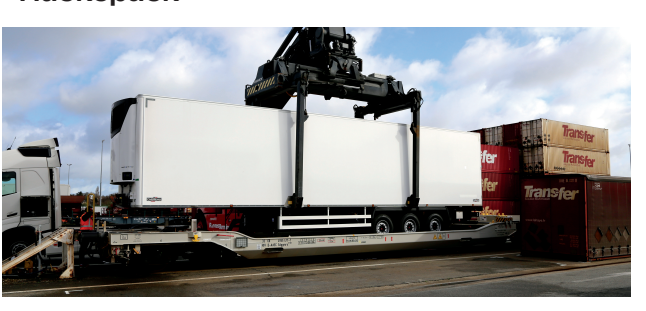
Combined road-rail transport: system for loading a complete semi-trailer on a pocket wagon