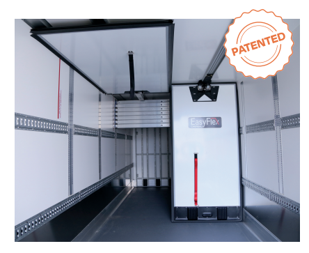
Lightweight and easy to use