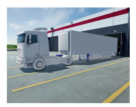
Comfort and safety for the driver

Anti-unplanned departure Safeloading-C<sup>(5)</sup>