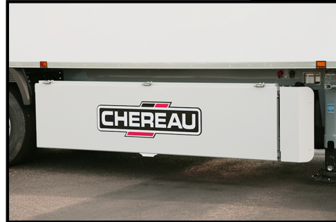
Front view with closed trunk